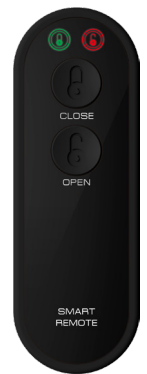
Optional RF Remote Key